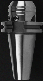
HYDRAULIC CHUCK (Power E)