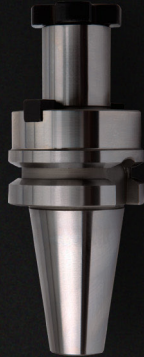
SHELL MILL ARBOR