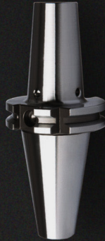
SHRINK FIT HOLDER