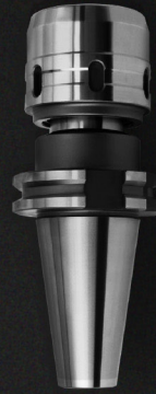
POWER MILLING CHUCK